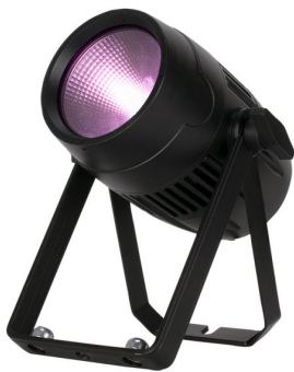
Encore Burst UV IP