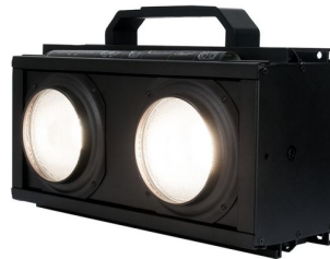
Encore Burst 200